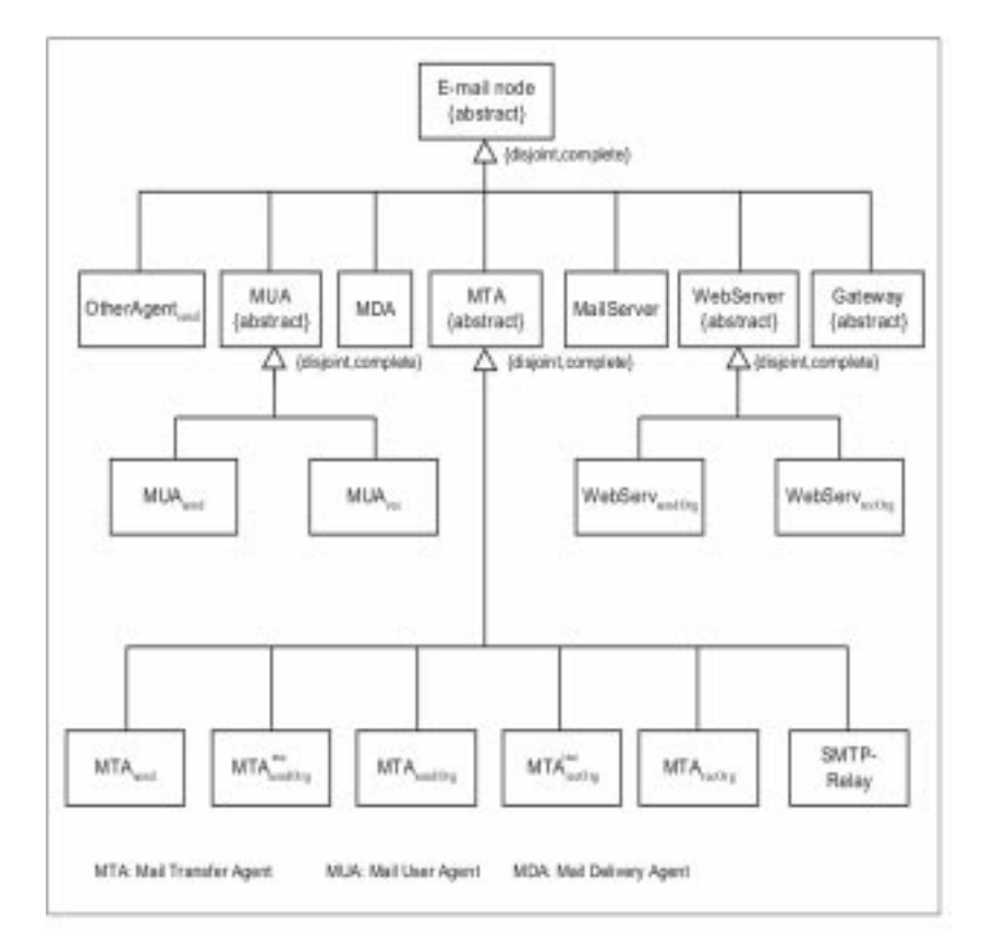
Fig. 2. Internet e-mail nodes.

MTA_{send} With a local MTA on the user's side, only SMTP connections are possible. SMTP connections can be established to an ESP's incoming MTA (e3), to Internet nodes accepting SMTP connections, viz. an SMTP relay (e2) and a gateway (e4), or to an MTA of the receiving organization or recipient (e1). Other connections are not possible.